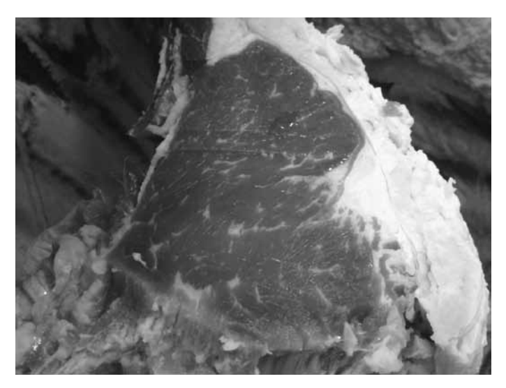
The view between the 12th and 13th rib where the quality measurements are taken on a Hereford Prime carcase.

Each supplying farmer is sent a Hereford Prime feedback sheet which clearly outlines how each carcase stacked up against the brands quality criteria.