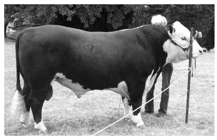
Willowspring Utopia 376 SUPREME CHAMPION ALL BREEDS RES: Willowspring Miss Britt 355