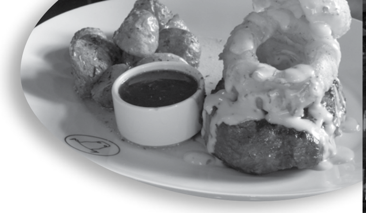
300gm Hereford prime served with onion rings and a mushroom sauce glaze.