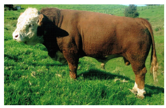
Gladwyn Heights Oben - DOB 11.10.13