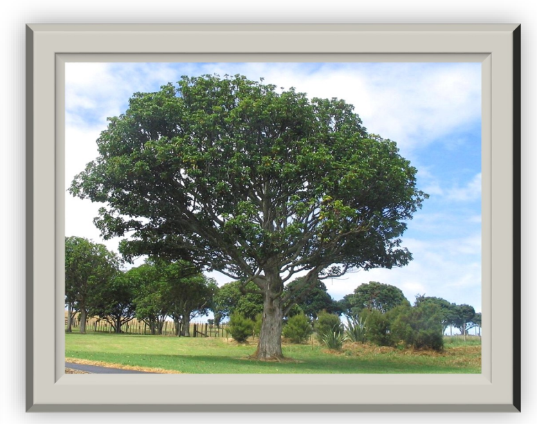
Puriri Tree at top, London Plane tree on the bottom left and Pohutukawa Tree below right