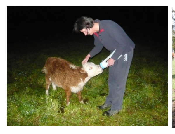
Suppa cuppa for a wee Rosaville orphan - Rangiora