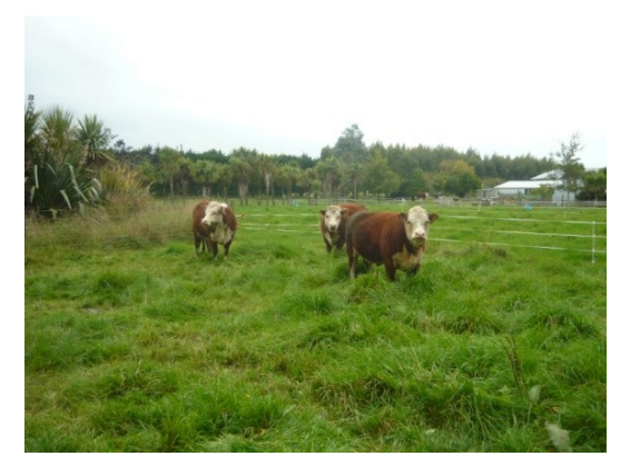
Up to their knees in grass at Ruzak Park