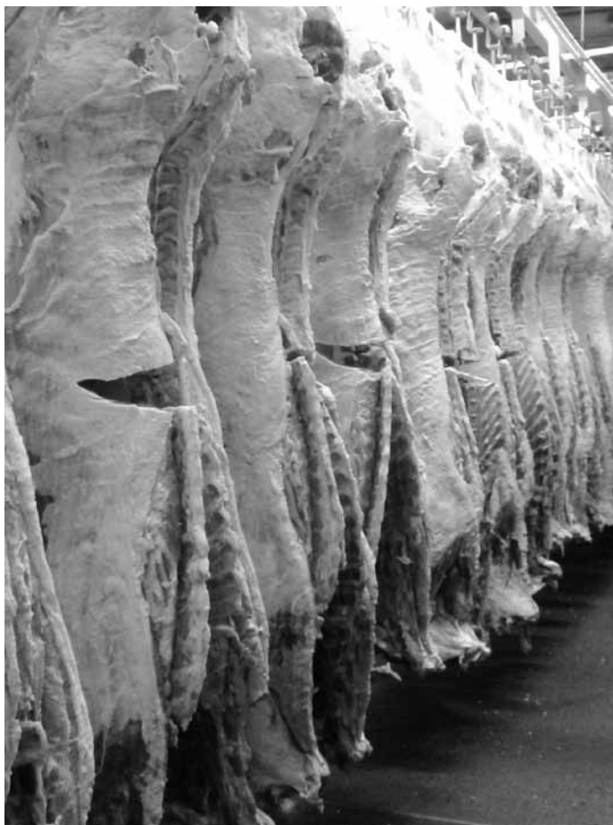
Bodies consigned for Hereford Prime in the chiller prior to testing. The cut indicates where the carcass measurements are taken.

Each supplying farmer is sent a Hereford Prime feedback sheet which clearly outlines how each carcass stacked up against the brand's quality criteria.