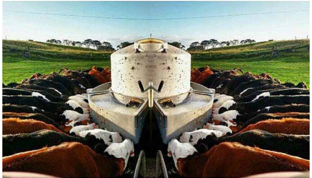
... THE WHITEFACE ADVANTAGE