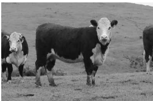
Yavenvale Heifer (Holysmoke daughter)