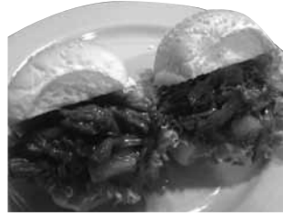
Then use in your favourite way.