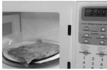
Pop the pulled beef in the microwave for three minutes on high.