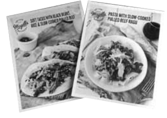
Don't forget to pick up the recipe cards when you're in store.

Magills Slow Cooked Pulled Hereford Beef is now available for purchase and it's an innovative new product that offers a mealtime solution for everyone.