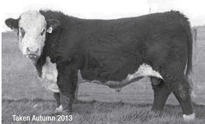
Taken Autumn 2013