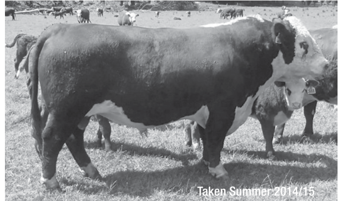
Taken Summer 2014/15