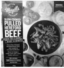
Keep an eye out in chillers for Magills Slow Cooked Pulled Beef.