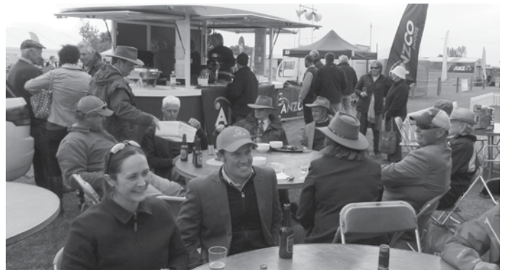
ANZCO Foods supported the Cattleman's BBQ at the Christchurch Show.