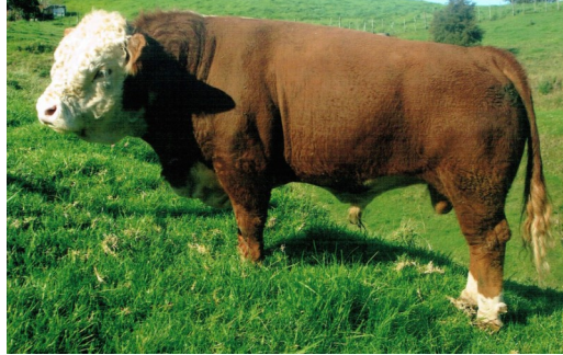
Gladwyn Heights Nathan - DOB 20.09.12