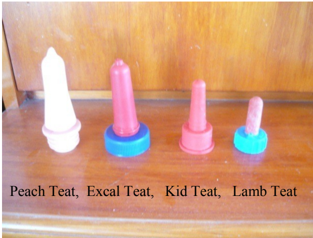
Peach Teat, Excal Teat, Kid Teat, Lamb Teat

With calving just around the corner for some of us if you have to feed a weak or very small calf that needs supplementary milk because mum doesn't have enough or isn't suckling well this teat is ideal. Available stock firms or you can order directly from Shoof. The teat is softer than the usual on calf feeders. The plastic bottle has an air valve which can be covered by your thumb if the calf starts suckling too fast.