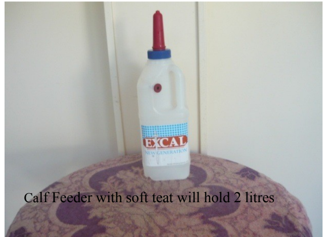
Calf Feeder with soft teat will hold 2 litres